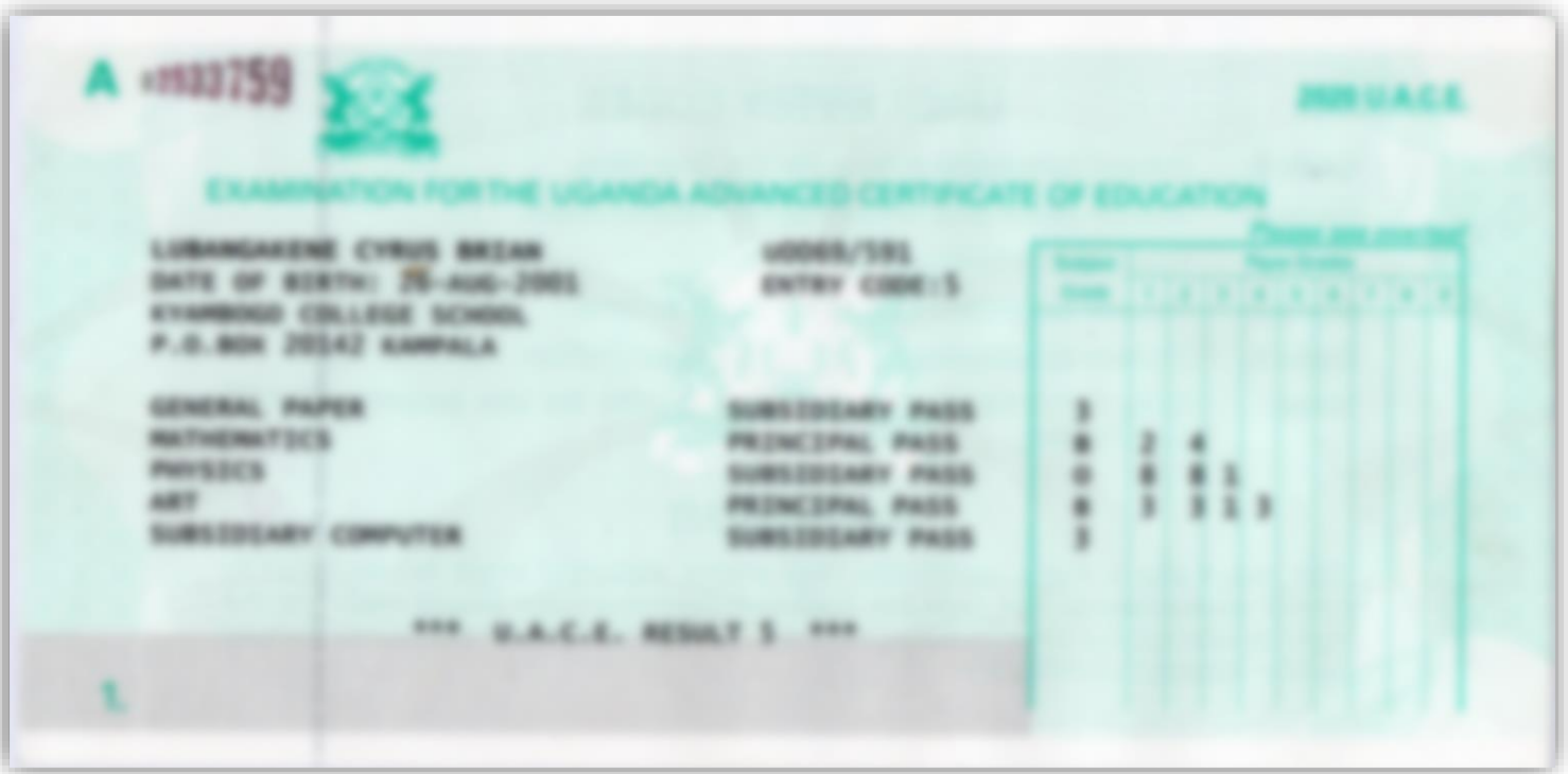
Figure 3: Result Slip for Uganda Advanced Certificate of Education (UNEBC) 2020