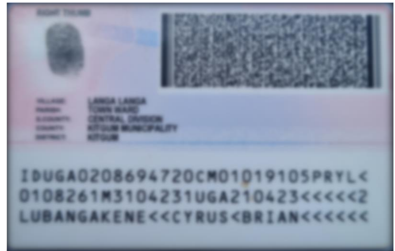
Figure 4: National ID - Back