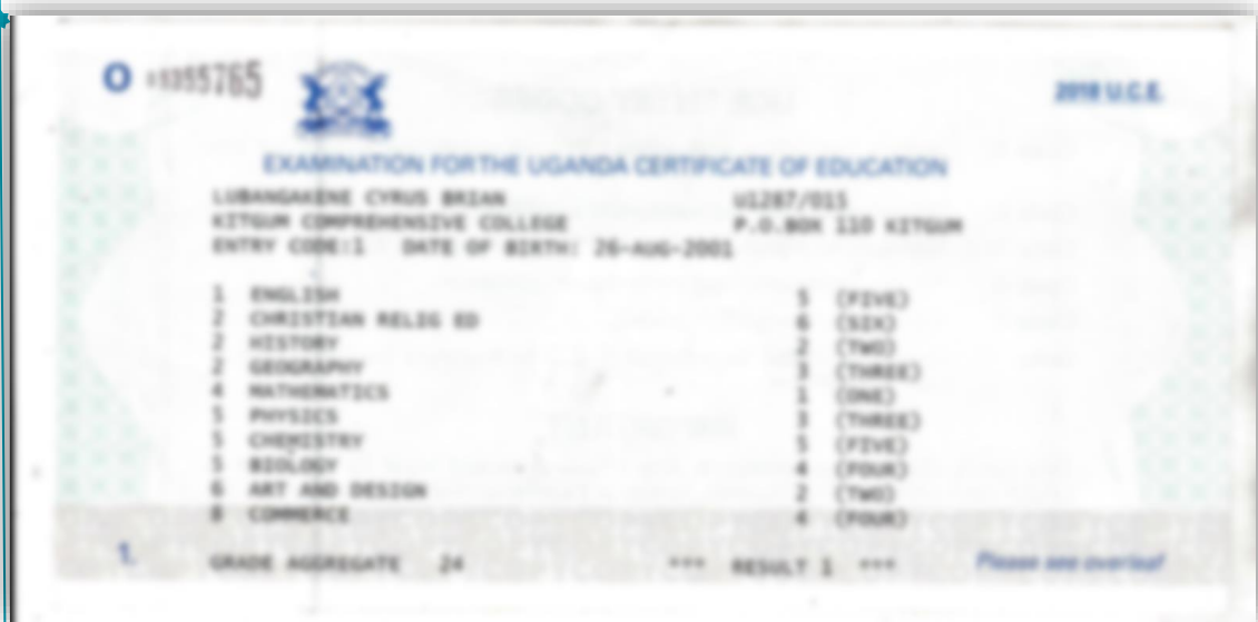
Figure 2: Result Slip for Uganda Certificate of Education (UNEB) 2018